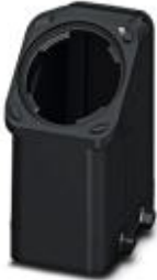
HEAVYCON EVO sleeve housing, plastic, with bayonet flange for EVO screw connection, B10, for double locking latch, height: mm, without EVO screw connection

Please be informed that the data shown in this PDF Document is generated from our Online Catalog. Please find the complete data in the user's documentation. Our General Terms of Use for Downloads are valid ( http://download.phoenixcontact.com )