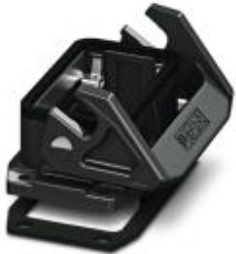
HEAVYCON EVO panel mounting base, plastic, B10, with single locking latch, height: 27 mm, with flat gasket

Please be informed that the data shown in this PDF Document is generated from our Online Catalog. Please find the complete data in the user's documentation. Our General Terms of Use for Downloads are valid ( http://download.phoenixcontact.com )