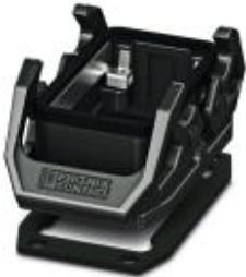
HEAVYCON EVO panel mounting base, plastic, B10, with double locking latch, height: 27 mm, with flat gasket

Please be informed that the data shown in this PDF Document is generated from our Online Catalog. Please find the complete data in the user's documentation. Our General Terms of Use for Downloads are valid ( http://download.phoenixcontact.com )