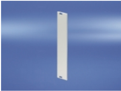
Illustration shows front panel 3 U, 4 HP