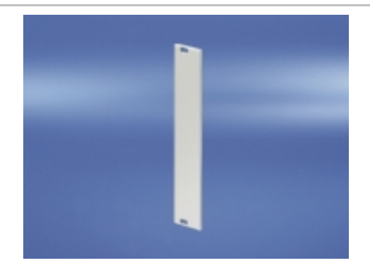
Illustration shows front panel 3 U, 4 HP