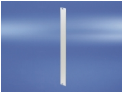
Illustration shows front panel 6 U, 4 HP