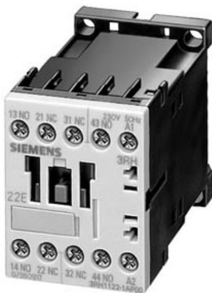
CONTACTOR RELAY, 2NO+2NC, DC 24 V, SCREW CONNECTION, SIZE S00