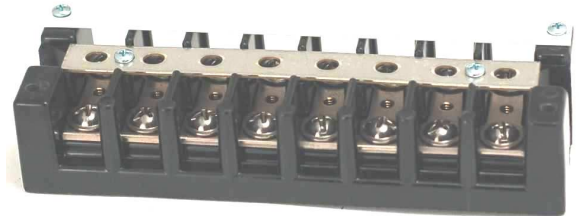
8 pole shown