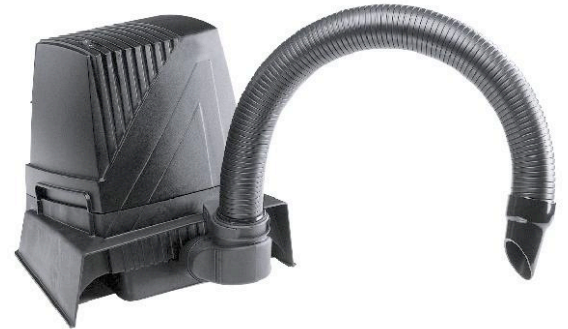
BVX-101 / BVX-103