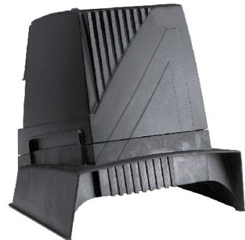
BVX-101-S / BVX-103-S