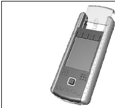
Figure 1. EvoPrimer base