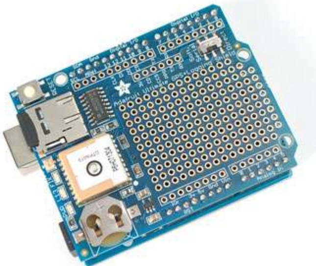
GPS Shield installed on an Arduino UNO using the on board antenna

If your project is going to be inside an enclosure, you'll love this shield as it has external antenna support. Simply connect an external active GPS antenna via a uFL/SMA cable to the shield and the module will automatically switch over to use the antenna. You can then place the antenna wherever you wish.