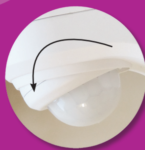
Vertically & horizontally adjustable PIR head