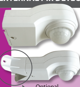
Optional corner bracket included