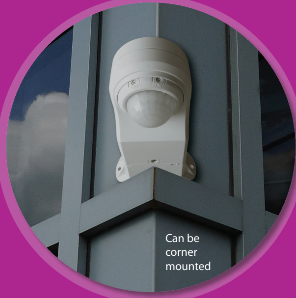
Can be corner mounted