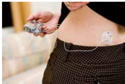
Fig. 2: Insulin pump

Many billions of lithium-ion batteries were manufactured in 2010. At the same time, the number of application areas for these products has also increased. These days, battery-powered devices can be found everywhere. And although these handy assistants are very useful, they also always present a source of danger. Any such device can catch fire, or an overcurrent condition can damage electronic circuits. In some cases, for example in medical technology, even a brief malfunction could place a patient's health at risk.