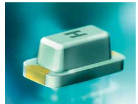
Fig. 4: USF 0402 super-quick-acting SMD fuse, 1.05 x 0.55 mm, with rated currents from 375 mA to 5 A.

Both fuses have been developed for the overcurrent protection of secondary circuits. The rated currents for the USF 0402 range from 375 mA to 5 A, while it has a rated voltage of 32 VDC up to 4 A and 24 VDC up to 5 A. The breaking capacity is specified at 35 A at rated voltage. The USFF 1206 was developed for smaller rated currents of from 50 to 250 mA; its rated voltage is 63 VDC and its breaking capacity is 100 A.