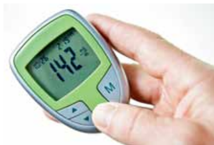
Fig. 3: Blood glucose meter

Many types of damage can be avoided with effective overcurrent protection. In principle, a fuse is sufficient for this purpose. Although unimposing, a fuse must meet a wide range of challenging requirements, if it is to provide for the efficient and effective safe operation of insulin pumps, hearing aids or blood glucose meters.