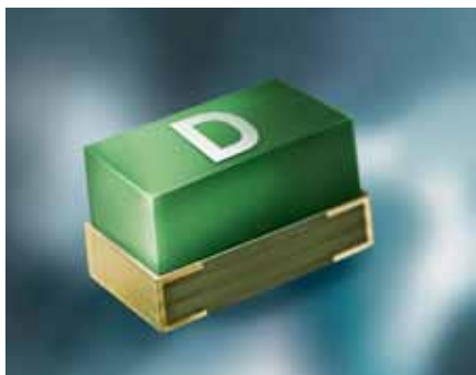
Fig. 5: USFF 1206 super-quick-acting SMD fuse, 3.2 x 1.6 mm, with rated currents from 50 mA to 250 mA.