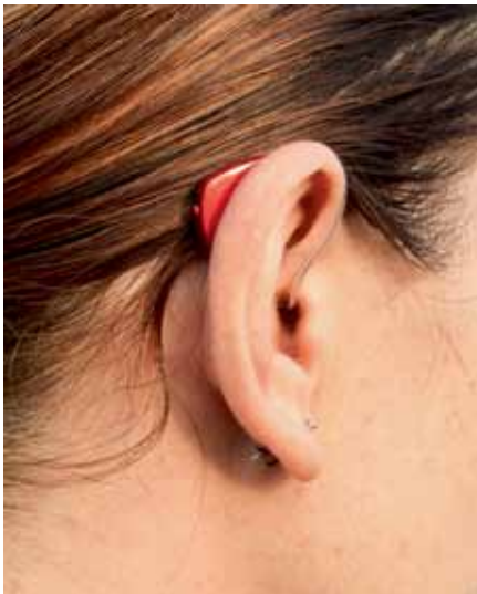
Fig. 1: Hearing aid

When it comes to safety technology, a short and precisely defined reaction time in the event of faults is important along with reliability across a wide temperature range. Both requirements have to be assured during the device's overall service life. Furthermore, the typical design parameters of standalone devices must be considered: The focus here is on low power consumption, small form factor and an attractive price/performance ratio. In addition, there are further desirable characteristics such as those relating to recycling.