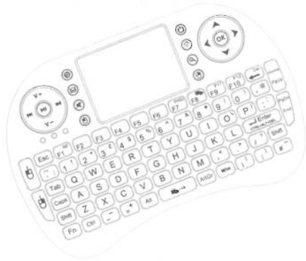
Mini wireless keyboard and touchpad