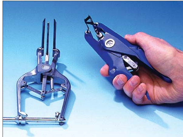
Fast, secure application with the three-pronged expansion tools.

The handy D kit contains a tool body and a range of prongs to enable the fitting of sleeves between 1.2mm and 11.5mm diameters. A small bottle of Hellerrine lubricant is also included.