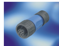
View represents all available contact positions.