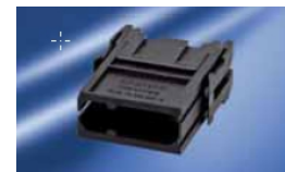
View represents all available contact positions.

Subseries Heavy duty connector heavy|mate® - C146 F