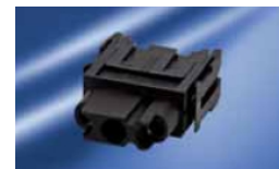
View represents all available contact positions.

Subseries Heavy duty connector heavy|mate® - C146 F