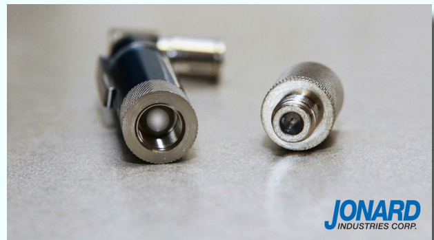
Convenient on/off switch