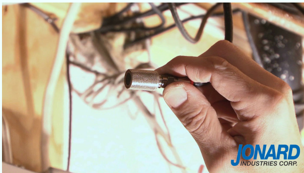
Loud tone identifies line carrying signal