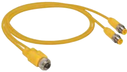
M12-Duo-Female to 2xM12 Male Str.

Splitter, double-ended, M12-duo, female straight to two M12, male straight connectors with self-locking threaded joint.