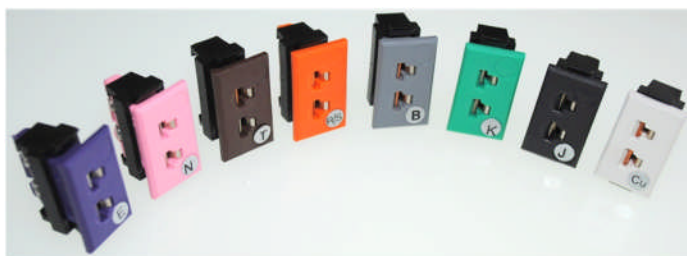
'Panel mounting sockets'