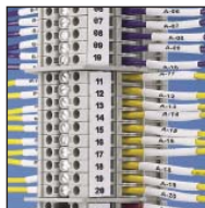
Terminal Block Labeling