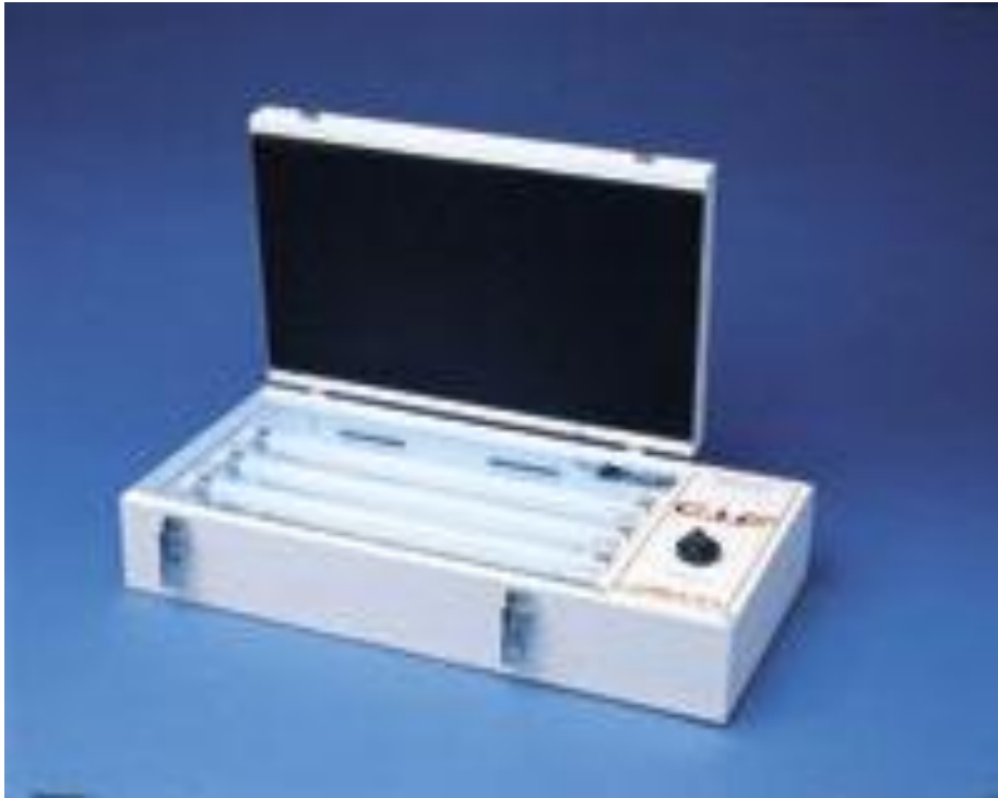
Single sided exposure unit CIF BC4