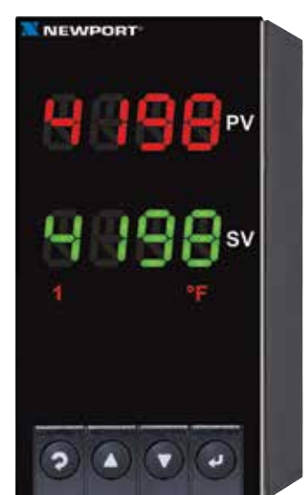
iS8DV33 shown smaller than actual size.

The universal temperature and process instrument (i8 models) offer a selection of 10 thermocouple types as well as 2-, 3- or 4-wire RTDs, process voltage and current. The i8DH and i8DV are ideal controllers for use with transmitters and amplified transducers. Built-in excitation is standard (24 Vdc @ 25 mA). The units handle 0 to 20 mA process current and process voltage in 3 scales: 0 to 100 mV, 0 to 1V, and 0 to 10V.