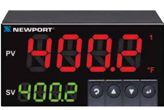
i8DH33 shown smaller than actual size.

The i8DH and i8DV come standard with your choice of 2 control or alarm outputs in almost any combination: solid state relays rated at 0.5 A @ 120/240 Vac; Form "C" SPDT relays rated at 3 A @ 120/240 Vac; pulsed 10 Vdc output for use with an external SSR; or analog output (0 to 10 Vdc or 0 to 20 mA) selectable for control or retransmission of the process value.