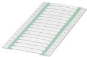
The illustration shows WMS 6,4 (30X10)R

Shrink sleeve, Roll, white, Unlabeled, Can be labeled with: THERMOMARK ROLL, THERMOMARK X, Perforated, Mounting type: Slide on, Cable diameter: 1.6-4.8 mm, Lettering field: 15 x 9 mm