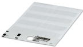
The figure shows a similar product

Cable marker label, Card, white, Unlabeled, Can be labeled with: THERMOMARK CARD PLUS, THERMOMARK CARD, Mounting type: Adhesive, Cable diameter: ≤14 mm, Lettering field: 25 x 19 mm