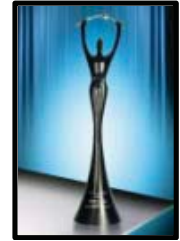
Elektra Award 2005