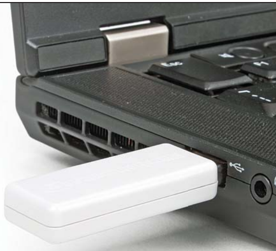
Figure 1-3: USB Dongle plugged into Laptop USB host connector

Yes. If you already have USB Dongle Licenses for other mikroElektronika software products, you can use them simultaneously on a single computer. If your computer doesn't have enough USB host ports, you can use additional USB hub.