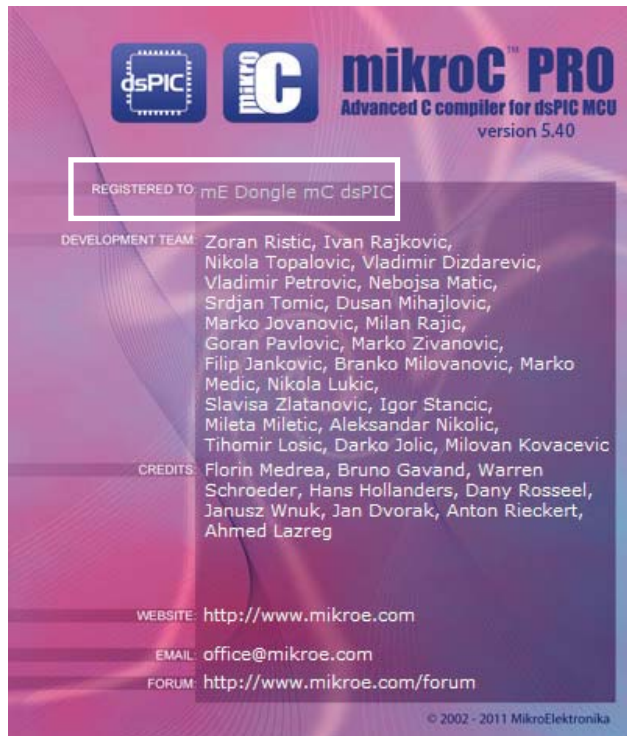
Figure 1-2: mikroC PRO for dsPIC® About Window