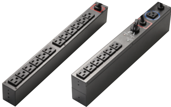
Optional FlexPDU and HotSwap MBP for greater flexibility and uptime