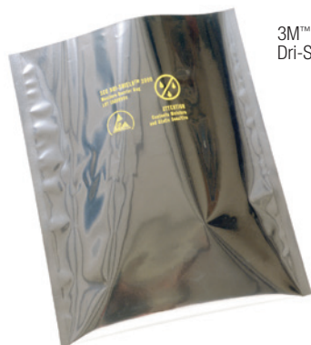
3M™ Moisture Barrier Bag Dri-Shield 2000

These bags are tested to meet or exceed certain electrical and physical requirements of ANSI/ESD S541, and to be ANSI/ESD S20.20 program compliant. Bags are RoHS Compliant* and lead-free**.