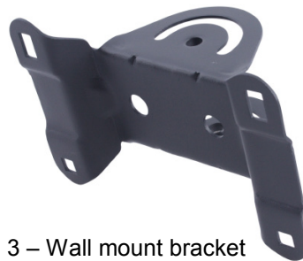
3 – Wall mount bracket