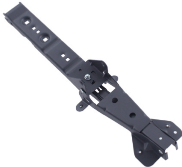
2 – Antenna bracket