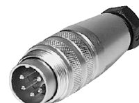
View represents all available contact positions.