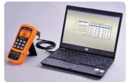
Figure 1. Automate the recording of continuous readings when you hook the U1701B to a PC

The handheld capacitance meter comes in a robust overmold and tested to stringent industrial standards. Each capacitance meter is also sealed with a three-year warranty and the assurance that you can test your components with confidence.