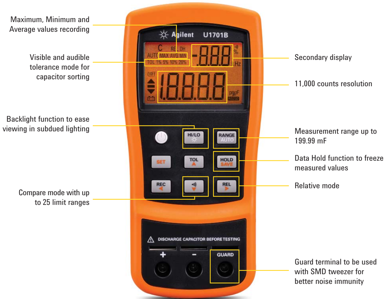
Figure 2. U1701B front view