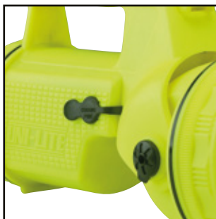
> Side Charging Point