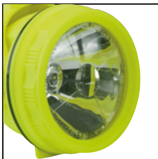
> Beammaster Lens

* Flashing mode specifications cannot be measured by ANSI FL1 standard. Flashing mode runtime is based on measurement of battery capacity change only.