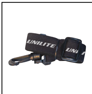
> Carry Strap