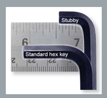
Stubby L-Wrenches eliminate the need to trim and file the short arm. A trimmed L-Wrench introduces burrs, and still does not have the tight radius of a dedicated Stubby L-Wrench.