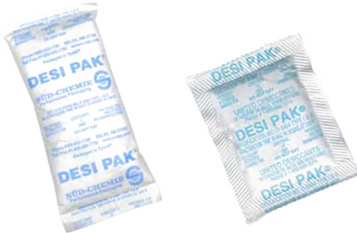
13843 & 13844

In order to provide a complete moisture barrier packaging assembly, desiccant must be inserted into the bag, prior to having the bag vacuum sealed. The recommended amount of desiccant is dependent on the interior surface area of the bag to be used. Figure 4 is a reference table indicating recommended minimum amounts of desiccant that should be used with Moisture Barrier Bags.