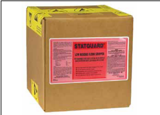
Figure 1. Statguard® Low Residue Floor Stripper