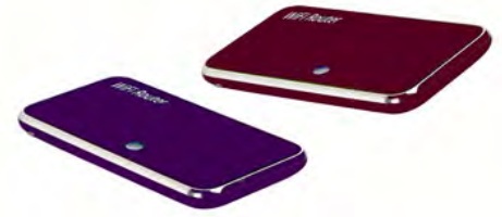
Mobile Wi-Fi* devices