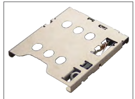
Nano-SIM Card Socket Shell, 1.30mm height (Series 78790)

Use with Ejector Tray (customer-supplied, customizable upon request)