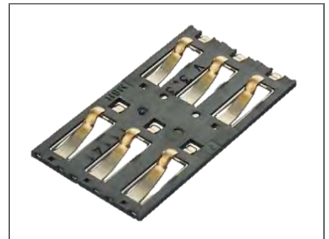
Block-Style SIM Connector, 0.30mm height (Series 78545)