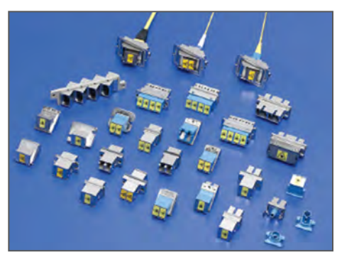
MPO (MTP*) Adapters Series numbers 106115 LC Duplex Adapters 106116 SC Adapter 106123 LC Quad Adapters