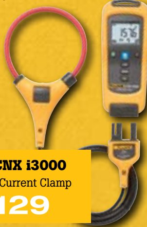
Fluke CNX i3000 iFlex™ AC Current Clamp £ 129

Connect any of the CNX™ Modules to your test point, and view the results up to 20 meters away on the CNX™ Wireless Multimeter. You'll save time, with less run-around collecting multiple measurements.