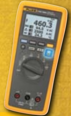
Fluke CNX 3000 Wireless Multimeter £ 259