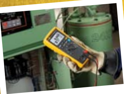
Use as stand alone