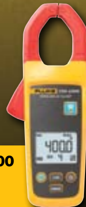
Fluke CNX a3000 AC Current Clamp £ 109