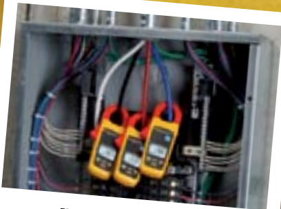
Use as data logger