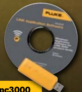
Fluke CNX pc3000 PC adapter £ 39