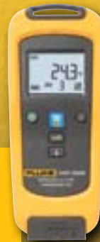
Fluke CNX t3000 K-type Temperature £ 109