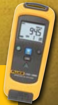
Fluke CNX v3000 AC Voltage £ 109