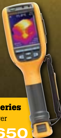
Fluke Ti100 series Thermal Imager From £ 1650