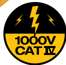
Fluke 1AC II