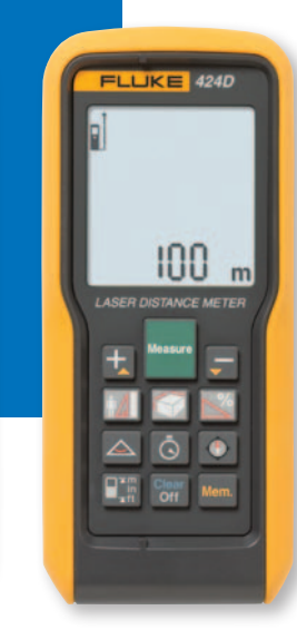
Fluke 414D, 419D and 424D Laser Distance Meters.