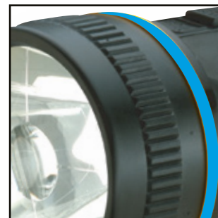
▶ Anti roll torch head