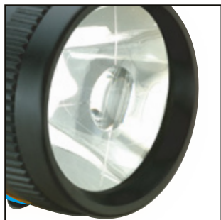
▶ Beamaster lens