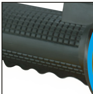
▶ Contoured S groove grip