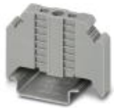
End clamp, width: 9.5 mm, color: gray