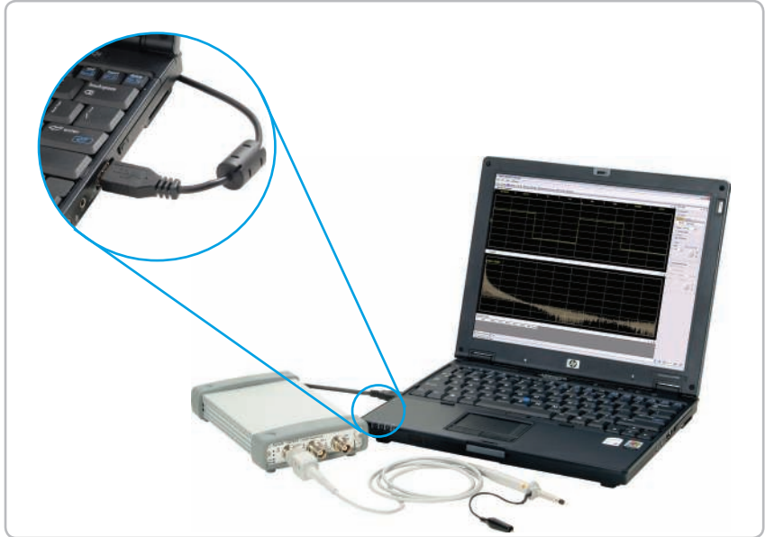
Figure 2. The U2701A and U2702A connect to the computer or laptop with a USB cable, enabling fast data transfer.

The U2701A and U2702A USB modular oscilloscopes offer analysis functions such as addition, subtraction, multiplication, division, and Fast Fourier Transform (FFT). FFT allows you to manipulate the waveform using five types of windows such as Hanning, Hamming, Blackman-Harris, Flattop, and Rectangular.