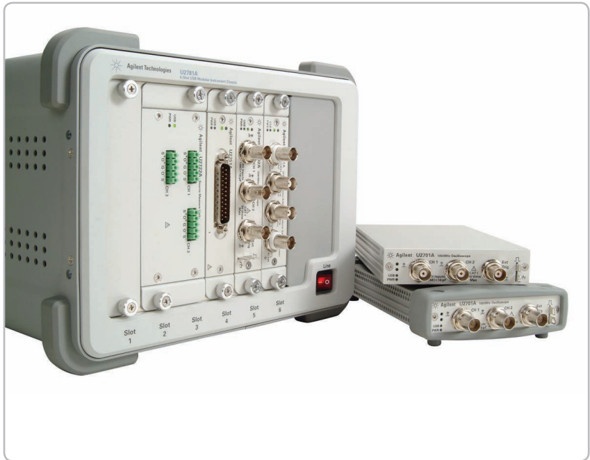
Figure 1. The dual-play capability allows the U2701A/U2702A USB modular oscilloscope to be used as a standalone unit or as part of test system in a cardcage.

The U2701A/U2702A USB modular oscilloscopes are equipped with High-Speed USB 2.0 interface for easy setup and plug-and-play. This ease of use makes the oscilloscopes ideal for the education, design validation and manufacturing industries.