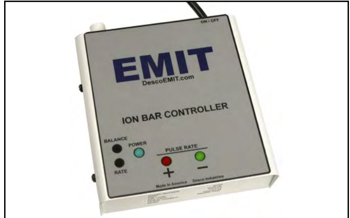
Figure 4. EMIT 50940 Controller with Recessed Potentiometer Adjustment