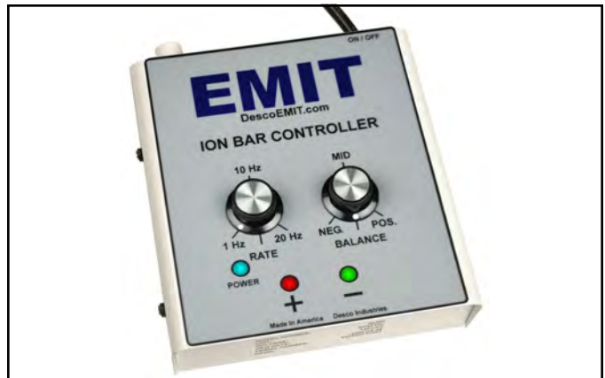
Figure 5. EMIT 50945 Controller with External Potentiometer Adjustment