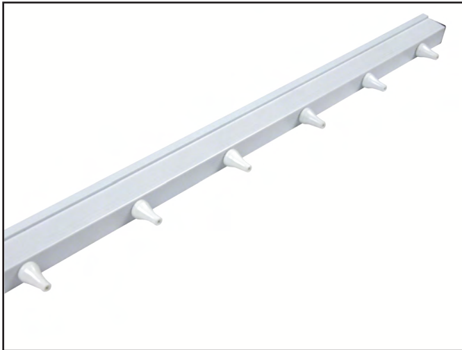
Figure 1. EMIT Air Assisted Ion Bar