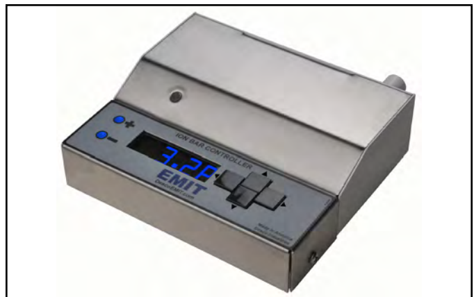
Figure 6. EMIT 50855 Controller with Digital Adjustment