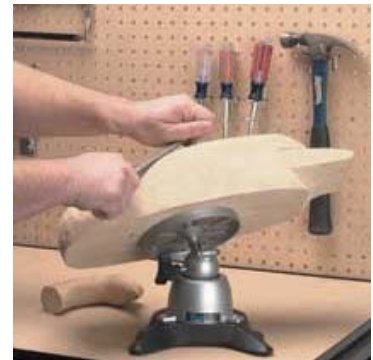
The more common use of a Model 337 Fixturing Head, wood carving.