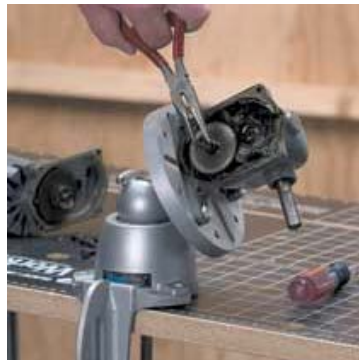
337 Fixturing Head being used to repair the gear box of an electric motor drive assembly