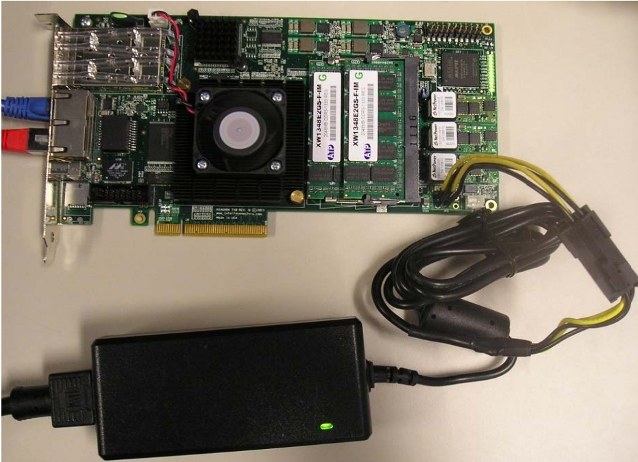
Figure 1 P4080PCIe standalone mode

Connect the provided customer power supply (P/N SA-125A0IV) to the P4080PCIe's 6 pins power cable receptacle.