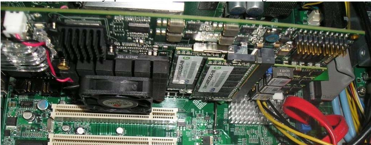
Figure 2 P4080PCIe in a PCIe x8 slot.

Insert the P4080PCIe to any open PCIe x8 or x16 slot as shown in Figure 2 P4080PCIe in a PCIe x8 slot