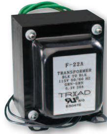
Case Type A