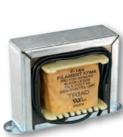
Case Type X