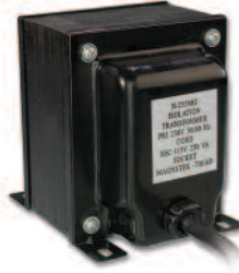
Case Type M