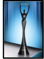
Elektra Award 2005