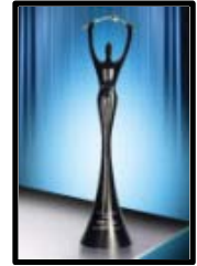
Elektra Award 2005